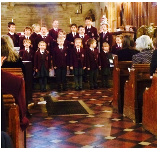
The Juniors sing their hearts out!